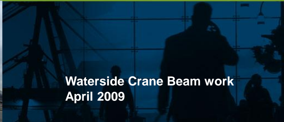
Waterside Crane Beam work April 2009